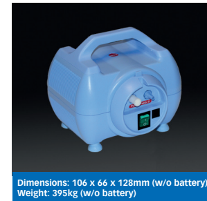
Dimensions: 106 x 66 x 128mm (w/o battery) Weight: 395kg (w/o battery)

The AirMed Travel-Air is a low cost option for a portable hand-held compressor nebuliser, which can be used worldwide, on a mains supply or a 12V DC lead. Travel-Air is supplied with a rechargeable battery and an AC adaptor.