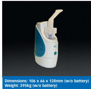
Dimensions: 106 x 66 x 128mm (w/o battery) Weight: 395kg (w/o battery)