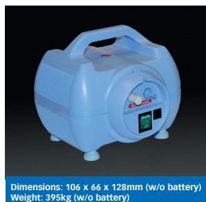
Dimensions: 106 x 66 x 128mm (w/o battery) Weight: 395kg (w/o battery)

A convenient method of bringing relief from discomfort caused by excessive mucus in the lungs, reducing complications associated with excess mucus production. For use at home, work or 'on the go.'