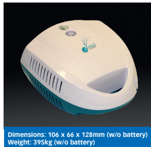
Dimensions: 106 x 66 x 128mm (w/o battery) Weight: 395kg (w/o battery)

The Turboneb 2 has the highest flow rate of all the Medix compressor nebulisers, for fast drug delivery. It is continuously rated, making it a cool running machine for demanding use, with an easy carrying handle. It is reliable and easy to use.