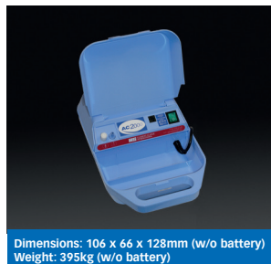
Dimensions: 106 x 66 x 128mm (w/o battery) Weight: 395kg (w/o battery)

There are a number of Year Packs on offer, these are compressor nebuliser specific. Please see the price list for more details. Each Year Pack provides the patient with enough replacement consumables to last for a 12 month period.