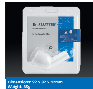
Dimensions: 92 x 82 x 42mm Weight: 85g

A high flow solution that is suitable for nebulising all commonly prescribed medications for chronic and acute chest conditions. Designed with a storage compartment for drugs and accessories to be neatly stored.