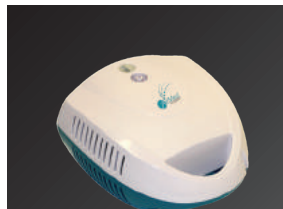
Dimensions: 175 x 112 x 140mm Weight: 138kg

Powerful, continuously rated unit; suitable for nebulising bronchodilators, corticosteroids and antibiotics.