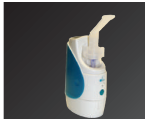
Dimensions: 106 x 66 x 128mm (w/o battery) Weight: 395g (w/o battery)