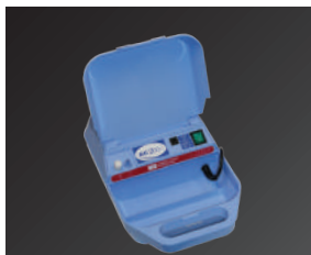
Dimensions: 375 x 235 x 115mm Weight: 2.45kg

The Turboneb 2 has the highest flow rate of all the Medix nebulisers, for fast drug delivery. It is continuously rated, making it a cool running nebuliser for demanding use; suitable for CF patients, easy carrying handle, reliable and easy to use.