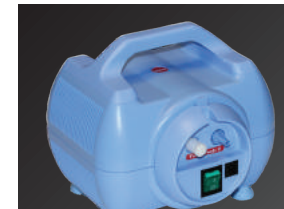
Dimensions: 210 x 185 x 185mm Weight: 2.7kg

Low cost option for a powerful compressor, suitable for respiratory conditions, such as asthma. Compact and lightweight, Airmed 1000 remains cool during demanding use, reliable performance.