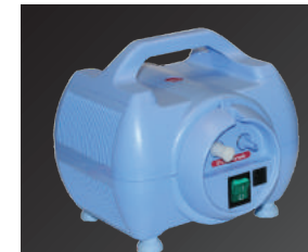
Dimensions: 210 x 185 x 185mm Weight: 2.35kg

The Airmed Travel-Air is a low cost option for a portable hand-held compressor, which can be used worldwide, on a mains supply or a 12V DC lead. Travel-Air is supplied with a rechargeable battery and an AC adaptor.